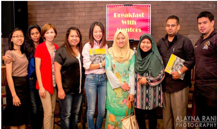
The Mentors with their Mentees

The mentors also shared many personal experiences and anecdotes that would surely encourage a future social entrepreneur.